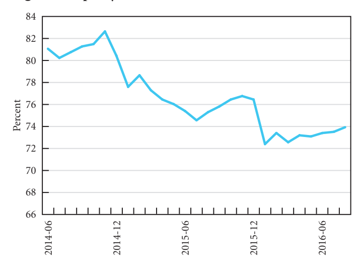
Figure 2 Capacity Utilization in the Industrial Sector

The fall in profitability affected investments in the industrial sector, since retained profits are (together with long-term credit from the Brazilian Development Bank [BNDES]—also currently under scrutiny by prosecutors) the main source of finance for investment. But declining profitability was not the only indicator pushing investment strongly downward: falling demand for industrial goods made production capacity