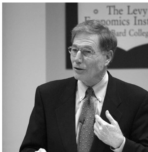
Michael H. Moskow

Moskow asserted that growth would remain solid and employment would accelerate. Among the factors he cited as making for strong growth were low interest rates, government budget deficits, replacement demand for capital equipment, and improvement in the economies of American trading partners. Many inflationary risks are present, Moskow noted, but, though inflation was up, it still stands at a relatively low level. He suggested that vigilance is the order of the day in dealing with the inflationary threat. The Federal Reserve will not be able to maintain an easy policy stance indefinitely.