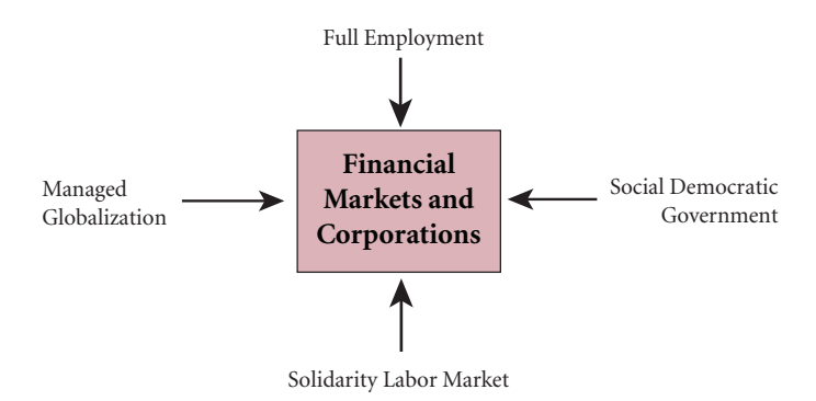
Figure 3 Repacking the Box

The neoliberal policy box is suggestive of an alternative, "progressive Keynesian" box that would align the interests of corporations and financial markets with that of the public, as shown in Figure 3. This requires redesigning and repacking the box as follows: