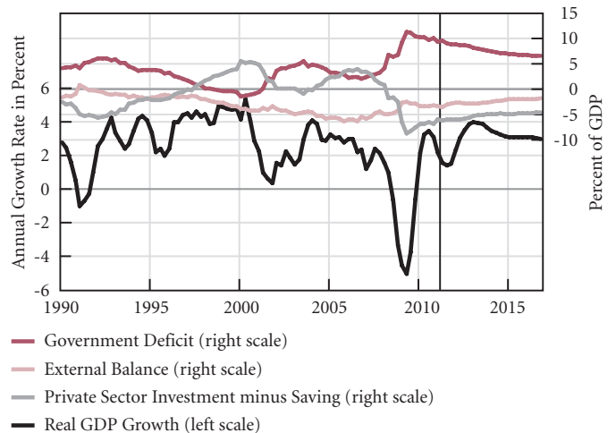
Figure 2 Scenario 2: US Main Sector Balances and Real GDP Growth