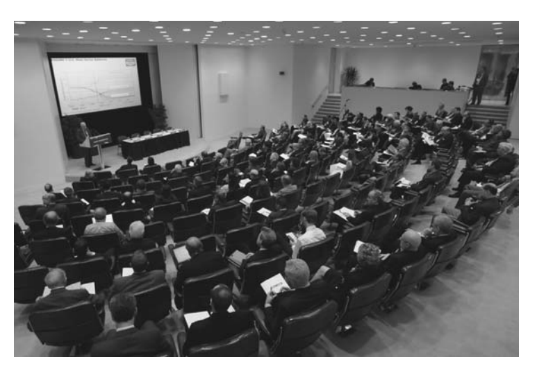
18th Annual Hyman P. Minsky Conference, Ford Foundation, New York City

On April 16 and 17, 2009, more than 150 policymakers, economists, and analysts gathered at the headquarters of the Ford Foundation in New York City to offer their insights into and policy guidelines for the extraordinary challenges posed by the global financial crisis. Topics included current conditions and forecasts; macro policy proposals by the Obama administration and others; the rehabilitation of mortgage financing and the banks; financial market reregulation; proposals to limit foreclosures and modify servicing agreements; regulation of alternative financial products (derivatives and credit default swaps); the institutional shape of the future financial system; and international responses to the crisis.